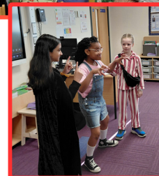
World Book Day Activities