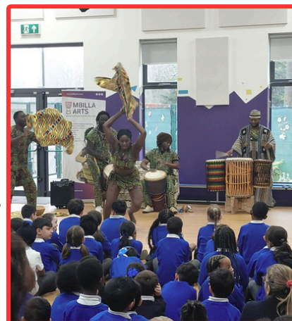
Mbilla Arts Workshop

It was also World Book Day, and it was wonderful to see the children celebrating their love of reading. During the morning, pupils took part in a carousel of different activities around the school, visiting different classrooms to enjoy a range of book-themed experiences. Children listened to a cosy bedtime story in the hall and library, took part in quizzes, designed their own comics and created playdough creatures inspired by the story The Day Louis Got Eaten . Many children also came dressed as their favourite book characters, adding to the excitement and fun of the day. We hope the day inspires children to continue exploring new stories at home and to develop a lifelong love of reading.