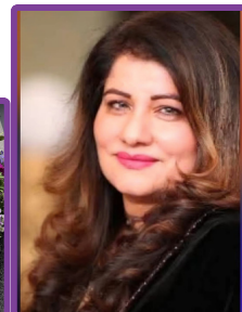
Forever in our hearts

Learning Labs Tuition are partnered with St Marys to provide additional support in Maths & English to our students. This will include Maths and English support, 11+ Grammar School preparation, SATs preparation, and help with school homework!