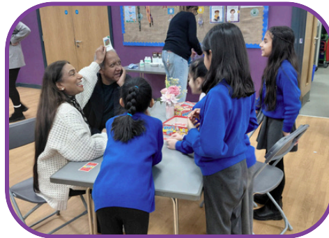
Grandparents' Coffee Morning

Learning Labs Tuition are partnered with St Marys to provide additional support in Maths & English to our students. This will include Maths and English support, 11+ Grammar School preparation, SATs preparation, and help with school homework!