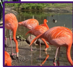
Year 1 trip to Hanwell Zoo