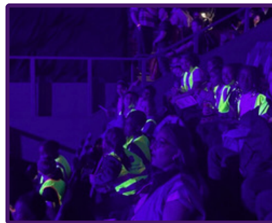
Voice in a Million at Wembley Arena