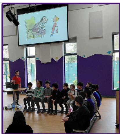
Year 3 Class Assembly